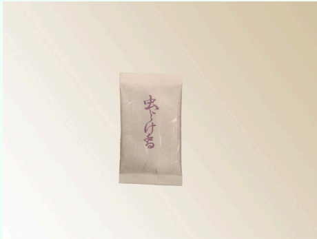
Bouchuukou (insect repellent)