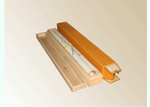
003. Open the paulownia box.

Take the paulownia box containing the kakejiku, out of "tatoushi" (the heavy paper box).