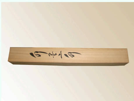
006. Close the paulownia box.

Place the kakejiku into the paulownia box.